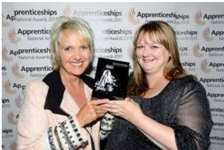
Elements Lifestyle - Winners of South Central Small Employer of the Year 2013 at the National Apprenticeship Awards.

Welcome to Apprenticeship News, the quarterly employer-focused newsletter from the National Apprenticeship Service in the South Central area that keeps you up-to-date with all things Apprenticeships. This newsletter aims to provide useful information to employers about skills policy and Apprenticeships and is sent to employers in the South Central area, which incorporates Brighton & Hove, Dorset, Hampshire & Isle of Wight, Surrey and West Sussex.